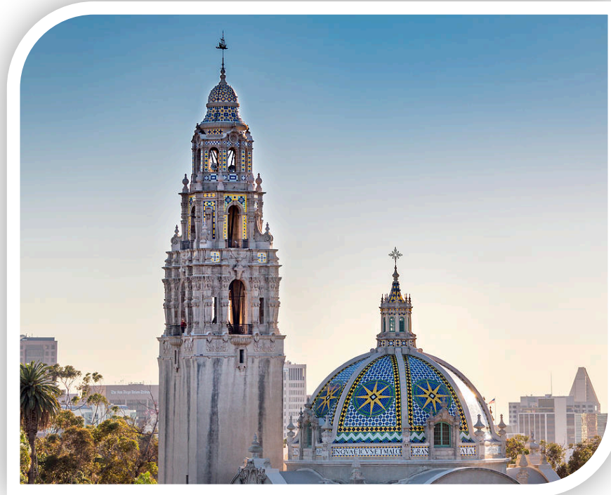
California Tower in Balboa Park, San Diego

Locate the 3-D model of the California Tower. Compare it to this picture of the same place. Which one provides the most details about the building?