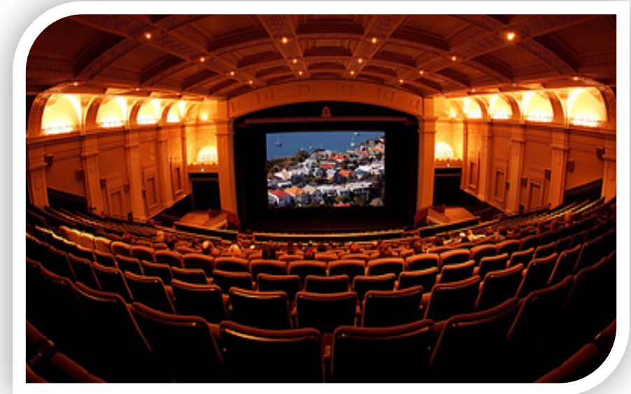
Movie theater today

In the past , drive-in movies were very popular. Now most people see movies in theaters.