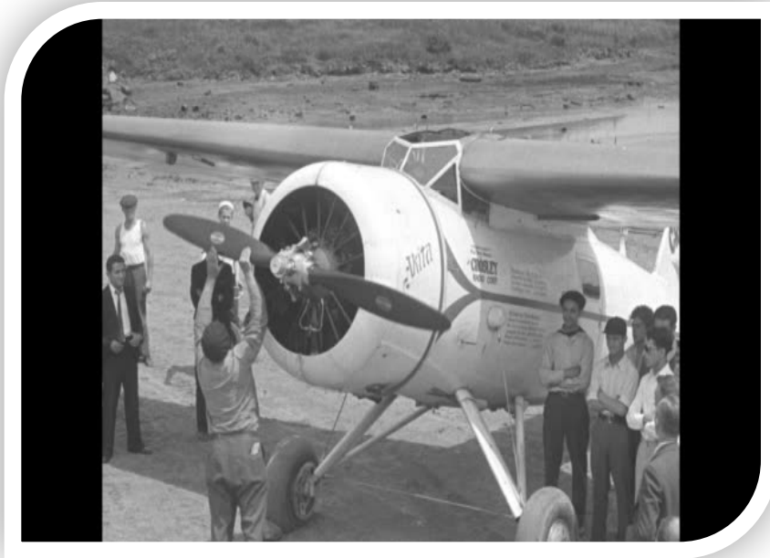
Man turning propeller