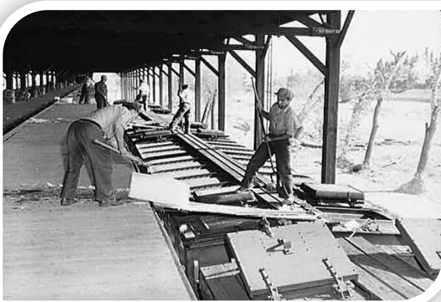
Refrigerated train car or reefer