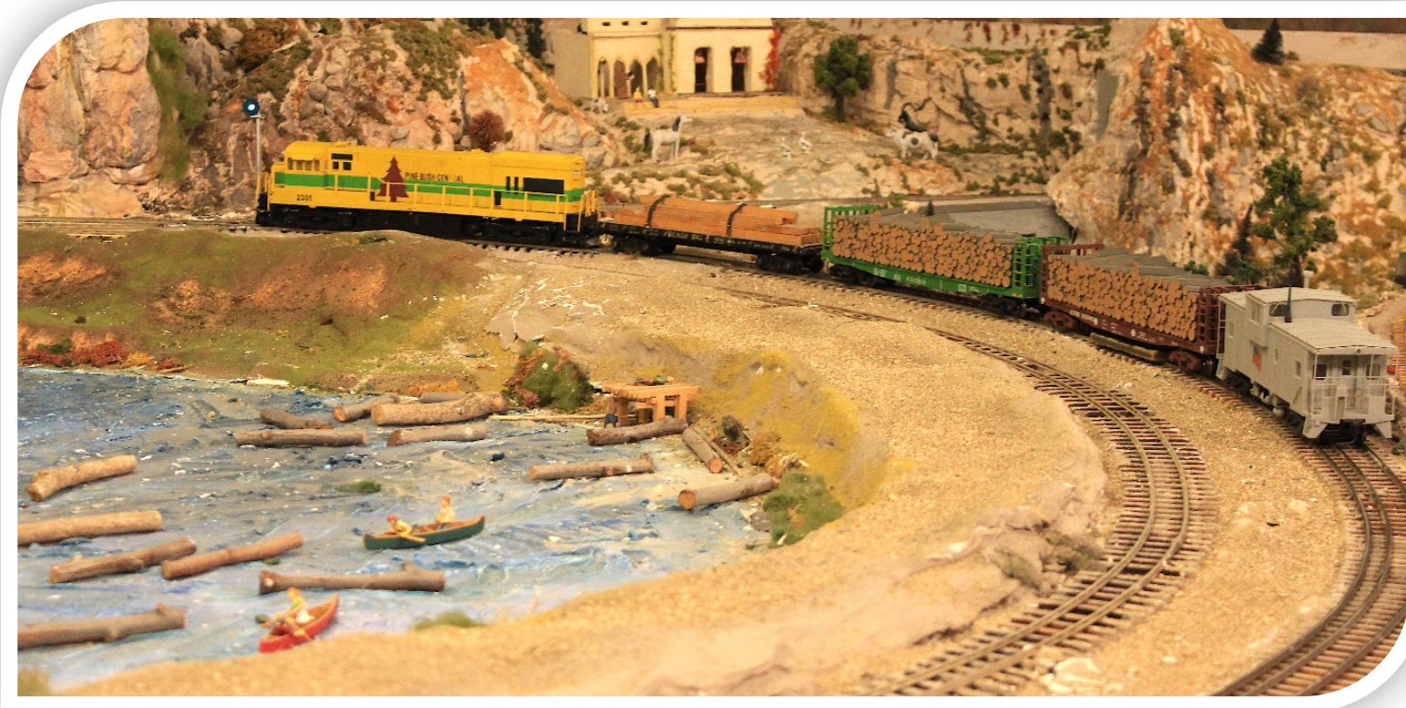
Model of logging railroad