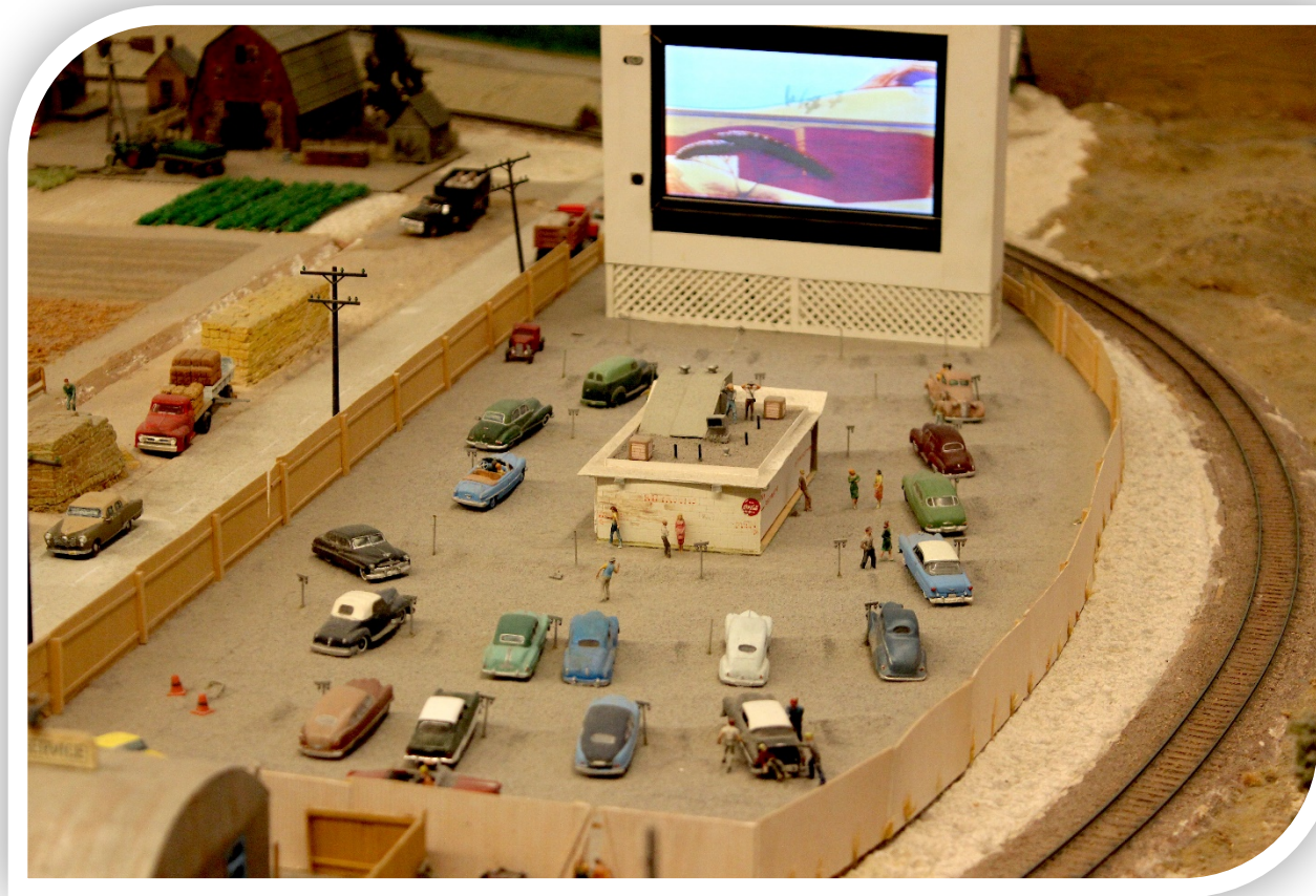
Model of 1950s drive-in movie