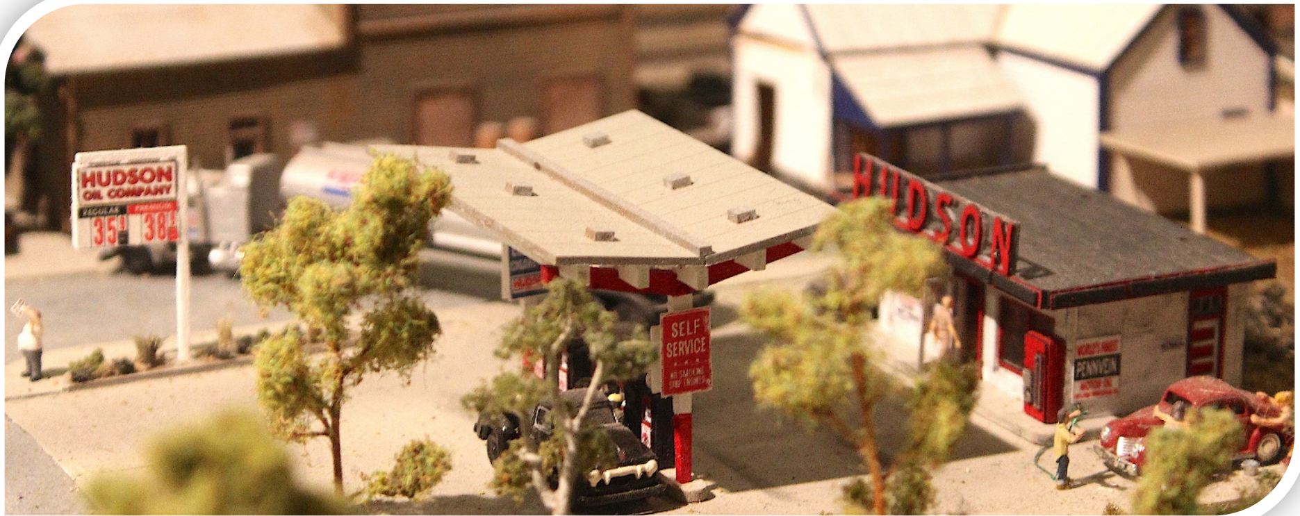
Model of 1930s gas station