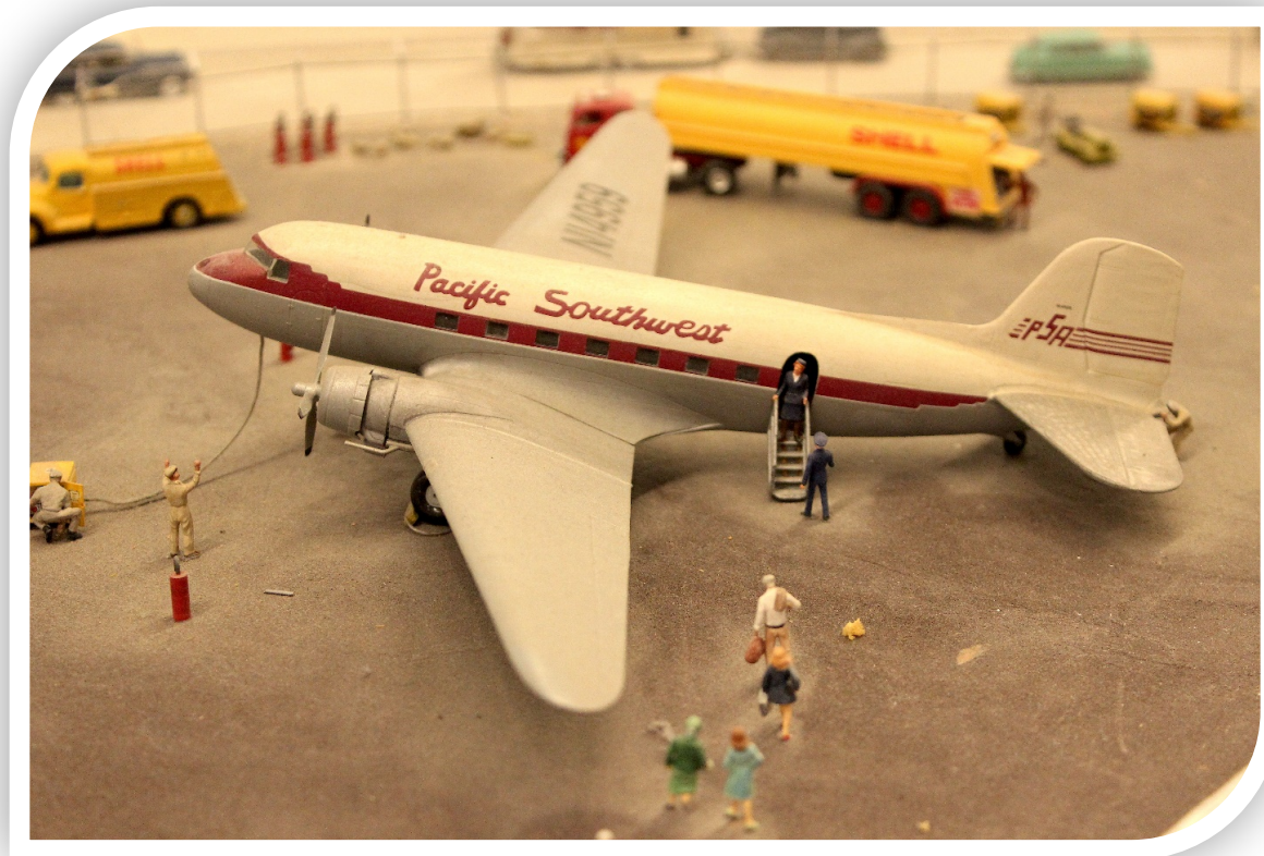
Model of people boarding plane using steps