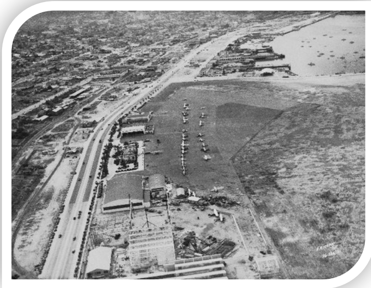
Lindbergh Field, San Diego, 1930s