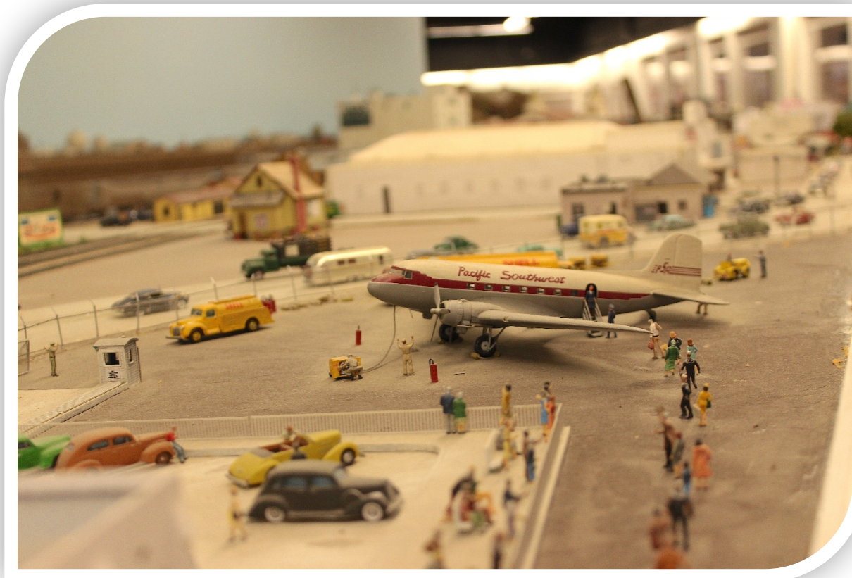
Model of people at Lindbergh Field, 1930s