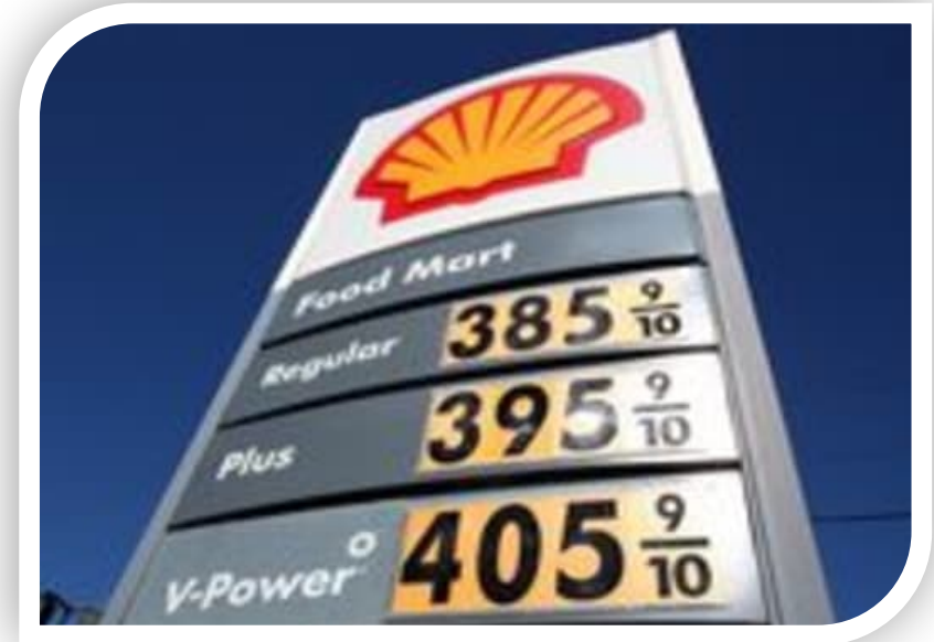
Current gas station sign

In the past, most things cost much less money than they do today.