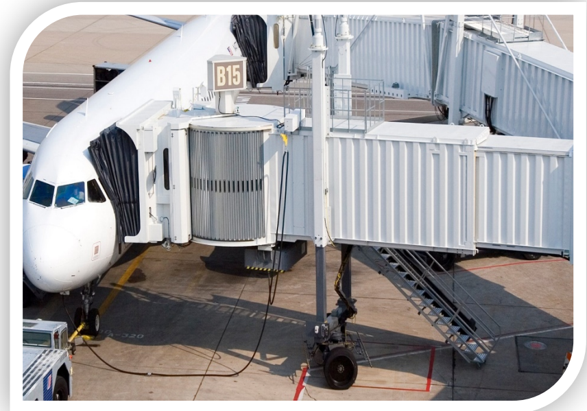
Boarding bridge or jet bridge

In the past , most people boarded planes using steps. Now most people use a boarding bridge.