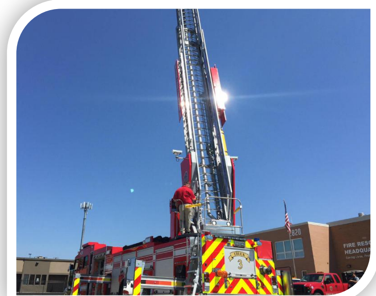
Fire truck with long ladder

In the past , firefighters used safety nets to rescue people trapped in tall burning buildings. Now they use long ladders or helicopters.