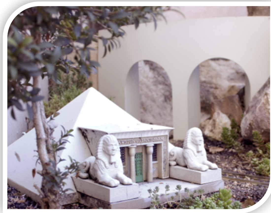
Model of Cawston Ostrich Farm from 1916