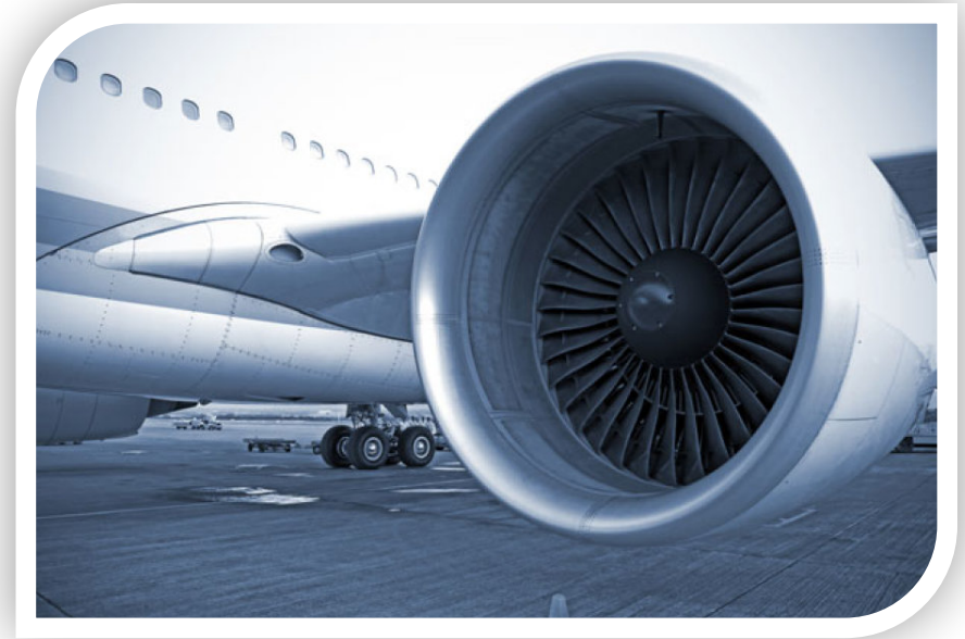
Turbo jet engine

In the past , people turned plane propellers by hand to get the engine started. Now turbo jet engines start automatically.