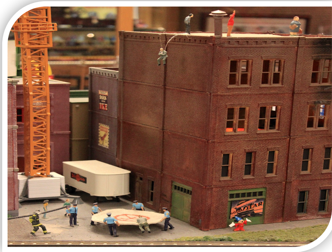
Model of firefighters using a safety net