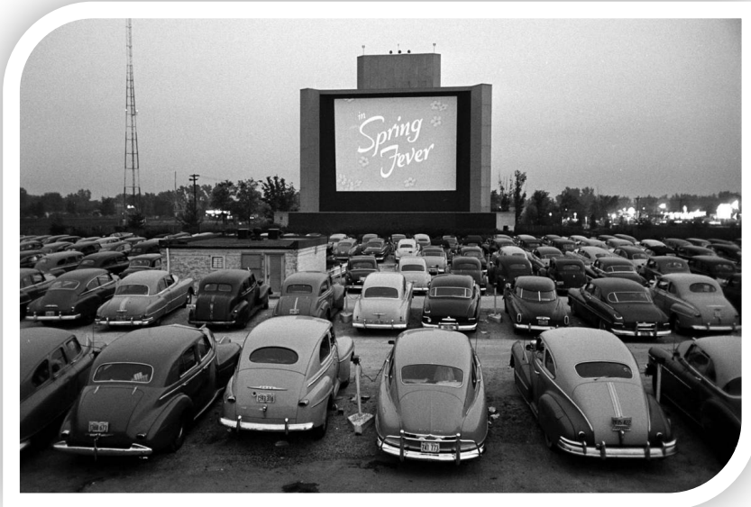
Drive-in movie theater from 1950s