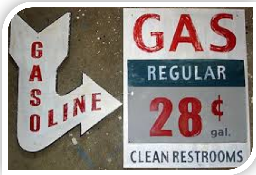
Gas station sign from about 80 years ago