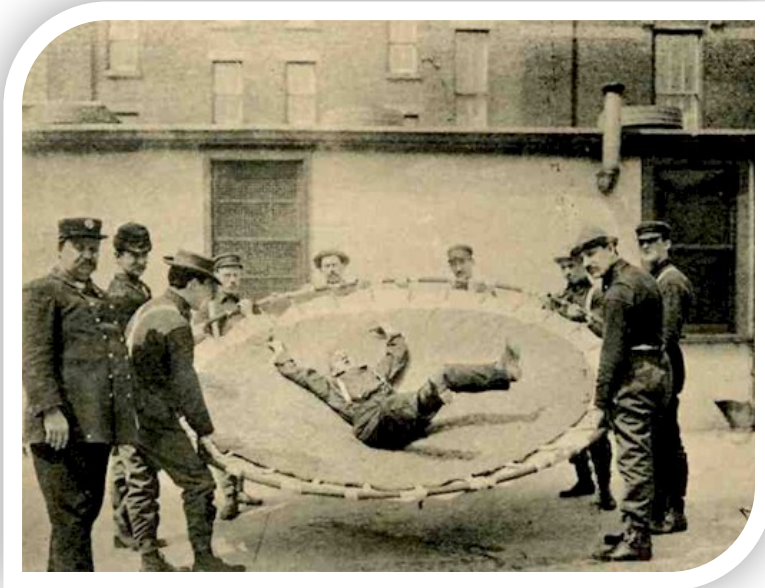
Firefighters with safety net