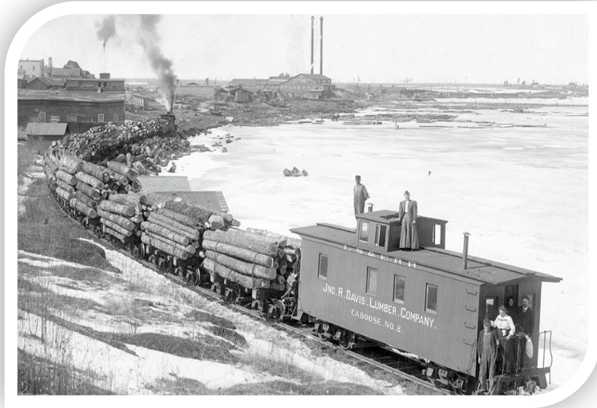
Lake Shore & Eastern Railroad, 1907