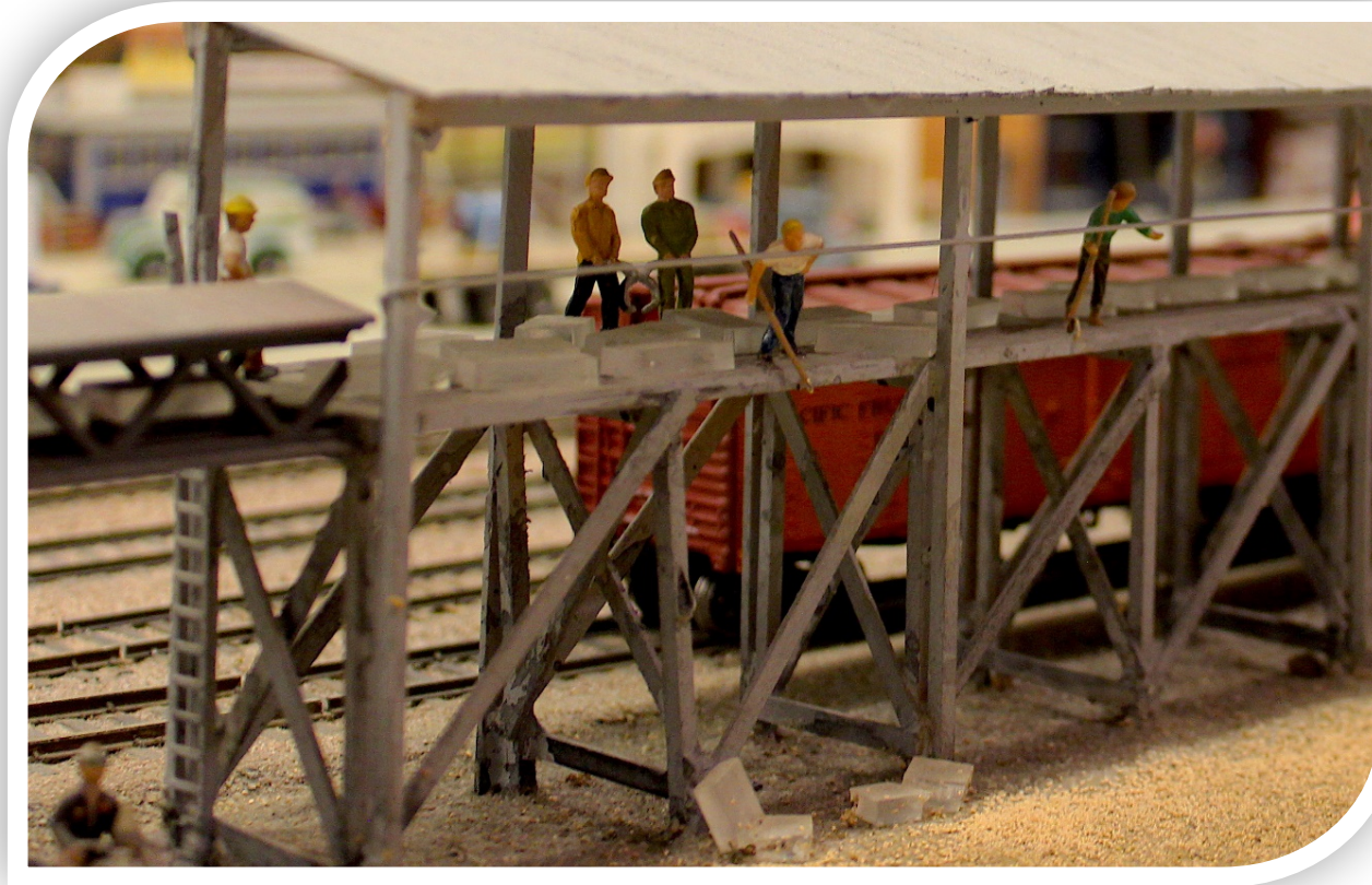
Model of the Union Ice Company, c. 1949