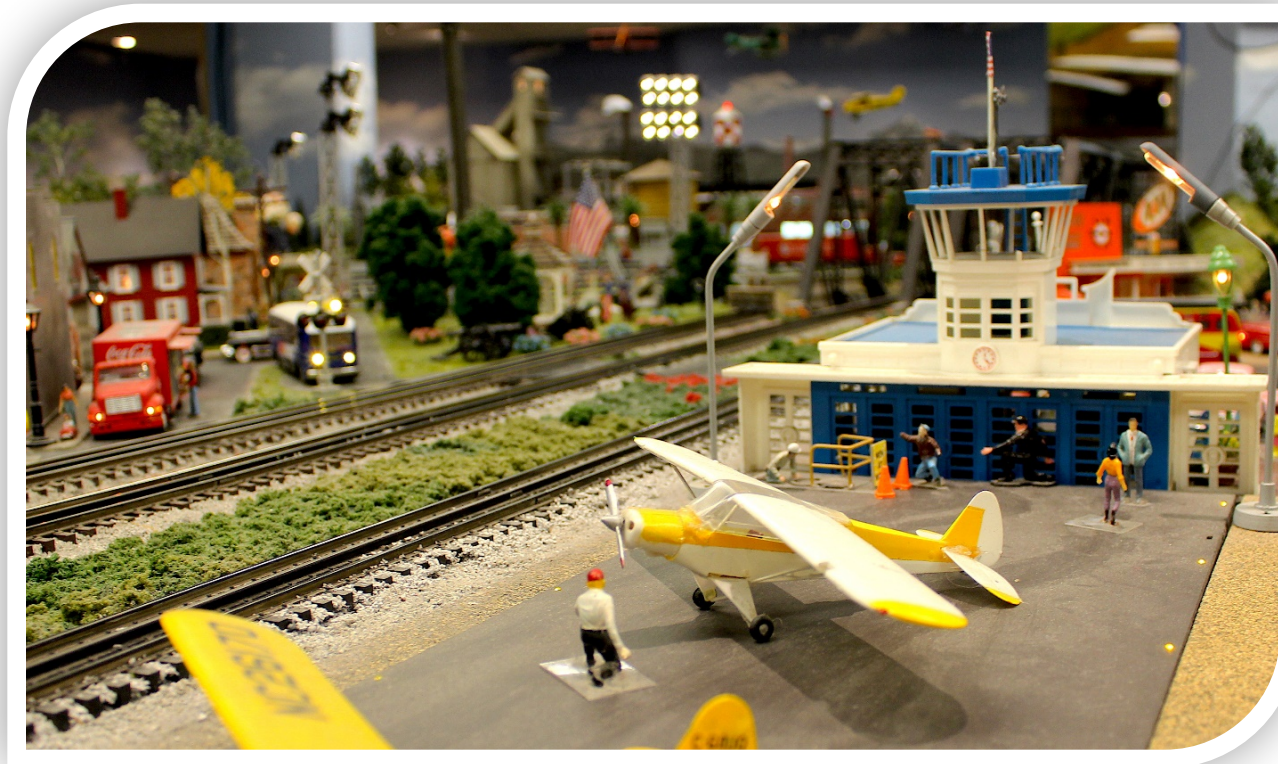
Model of man turning propeller