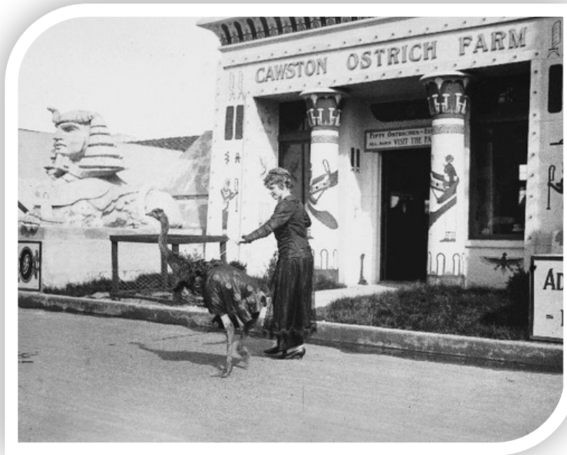
Cawston Ostrich Farm, Balboa Park, 1916